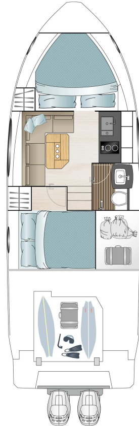
LOWER DECK option