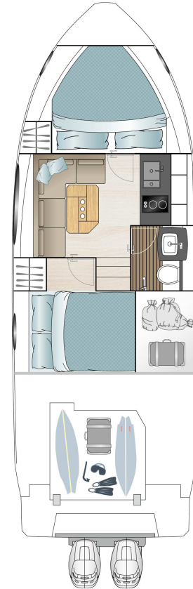
LOWER DECK option