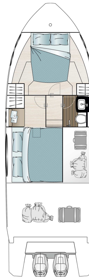
LOWER DECK optional