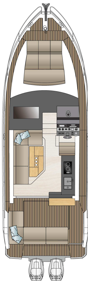
MAIN DECK standard