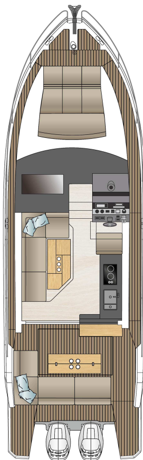
MAIN DECK optional