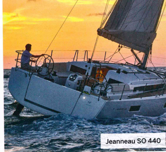
Jeanneau SO 440