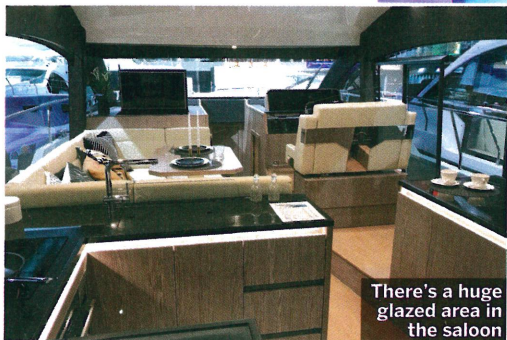
There's a huge glazed area in the saloon