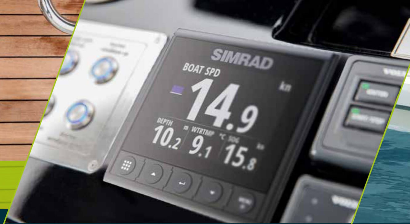
Simrad IS42 multipurpose instrument

Due to the impressive range of special gadgets, smart devices, useful details and engine options, individualising your FJORD 44 open can be as enjoyable as driving her. Take a look at your countless configuration possibilities.