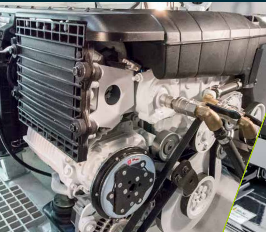
powerful double engine