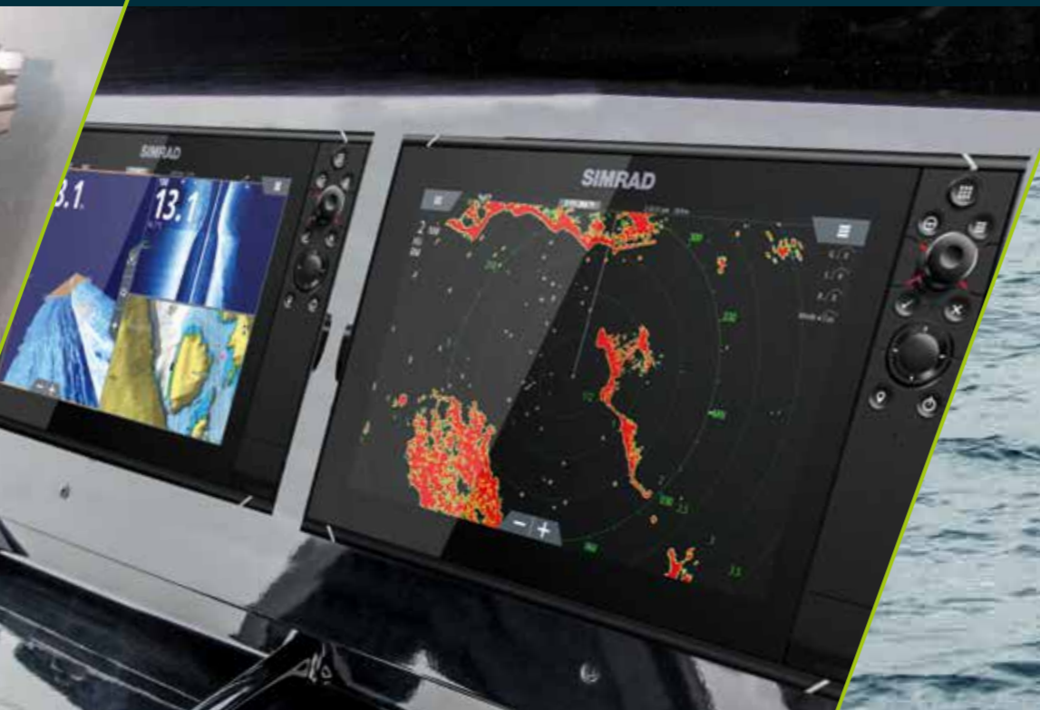
double chart plotters