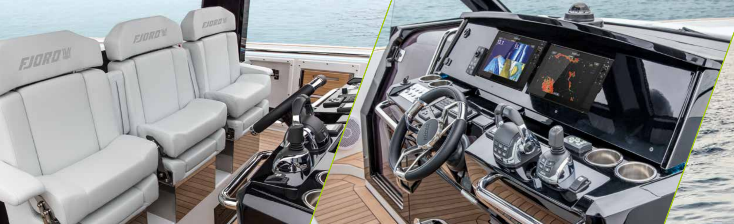
smart seat design for standing and sitting position | stylish and clearly arranged dashboard