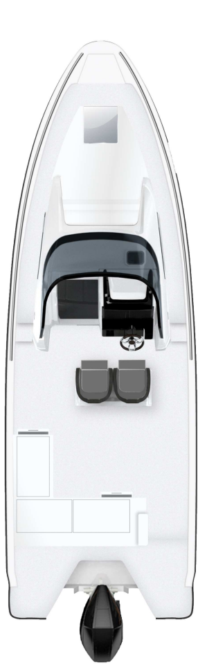
STANDARD Fiberglass deck