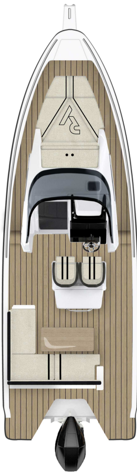
OPTION Table, wetbar, bench & bow upholstery