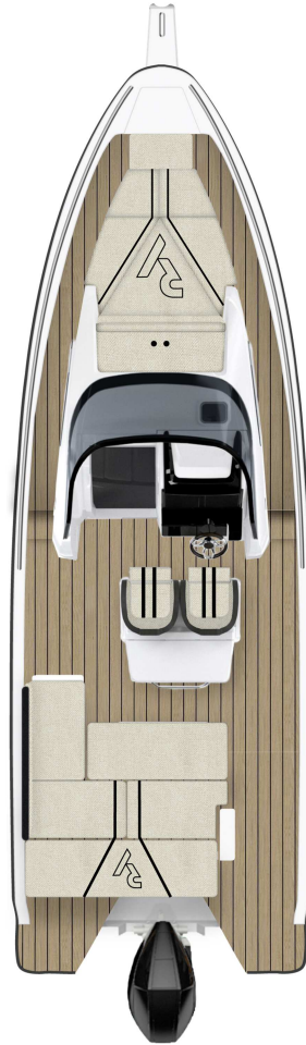
OPTION Back rest lower & raise, wetbar